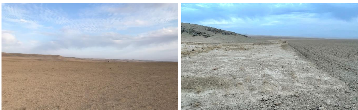
Figure 2: Project Site Area (left) and Route of Overhead Line (right)