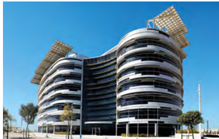
International Renewable Energy Agency (IRENA) HQ Awarded the 4 Pearl Estidama certification in 2014 and The Big Project Middle East Award.