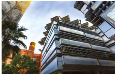
Mohamed bin Zayed University of Artificial Intelligence (MBZUAI) The world's first university dedicated to artificial intelligence. The graduate-level, research-based academic institution will offer specialised degree programmes for local and international students in the field of Artificial Intelligence from September 2020.