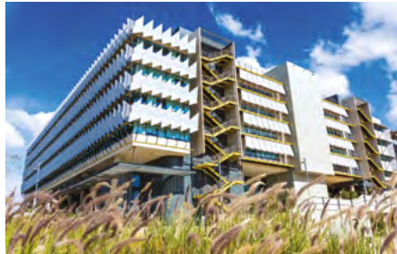
Siemens Middle East HQ LEED Platinum and 3 Pearl Estidama certifications. MEED Quality Award for Projects 2013.