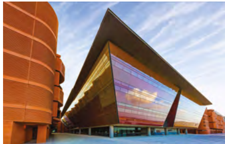
Incubator Building Home to many entrepreneurial businesses and the convenient One-Stop Shop which offers several vital business services.