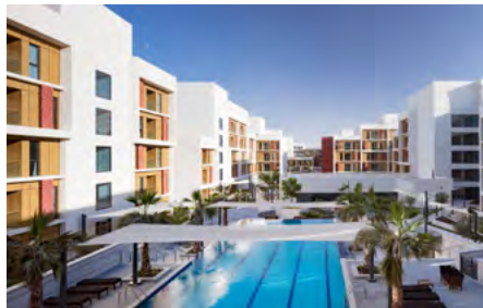
Etihad Eco Residence LEED Platinum and 3 Pearl Estidama certifications. Offers 500 units, comprising 1-bed and 2-bed apartments.