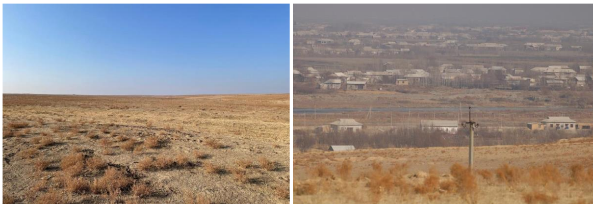
Figure 2: View to the centre of the site (Left) and Zarafshan river to the north of the site (Right)