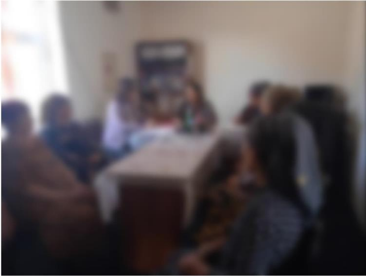
Figure 6-1 Meeting with the women of Bog'obod makhalla