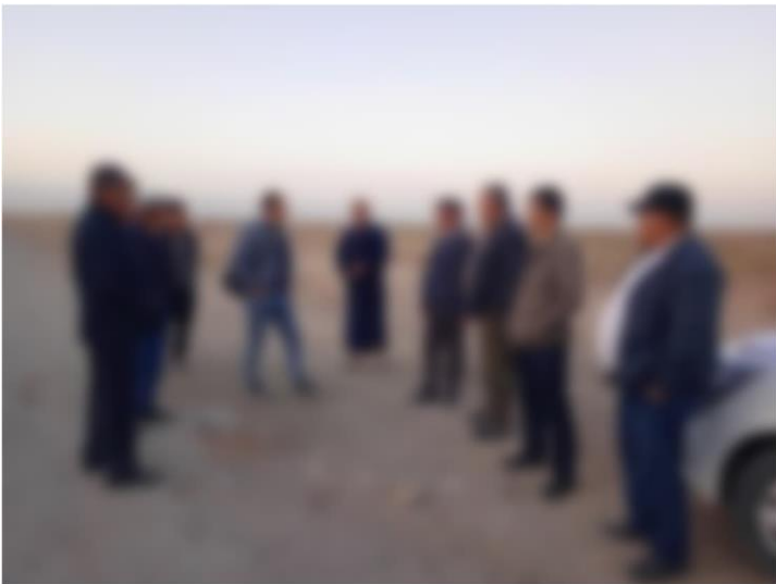
Figure 6-3. Meeting with mahalla leaders and cemetery representatives of Muzrabad district