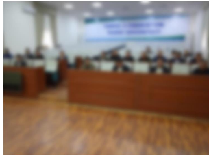
Figure 6-4. Meeting with farmers