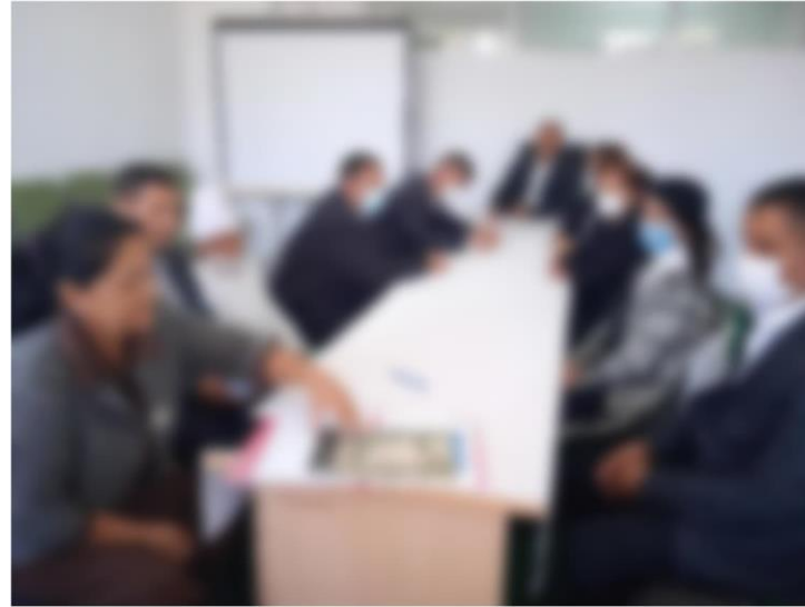
Figure 6-2. Meeting with teachers and administration of School №41